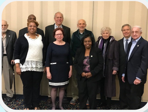
Picture: City of New Carrollton Legislative Dinner 2017

The City of New Carrollton's Annual Shredding Event was held on Saturday, November 18, 2017. The event, was a great success. The City of New Carrollton would like to thank all the residents who participated in the Shredding Event as we shredded 8,480 pounds of paper at the event.