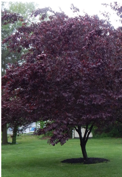
Beautiful tree planted on the City's Veteran's Park, located on Riverdale Road and Lamont Drive.