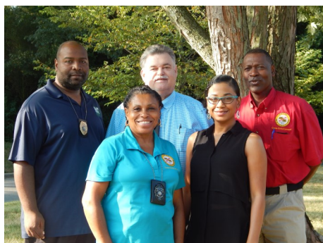
The City of New Carrollton Code Enforcement Team, left to right: