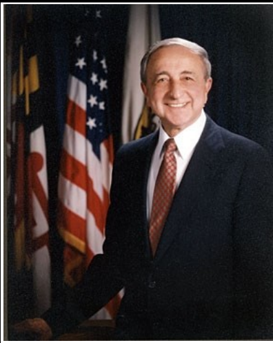
Mayor Andrew C. Hanko

New Carrollton Municipal Building 6016 Princess Garden Parkway New Carrollton, Maryland 20784