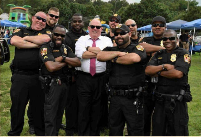
Governor Larry Hogan with New Carrollton Police Officers

The New Carrollton Police Department's National Night Out was a huge success, despite the early ending brought on by the weather. Governor Larry Hogan joined the festivities and took time to pose for a picture with some of our outstanding officers. We would like to thank everyone that came out. We Congratulate our Police Department, and give a big