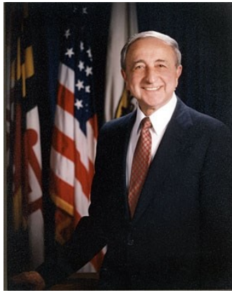
Mayor Andrew C. Hanko

6016 Princess Garden Parkway New Carrollton, Maryland 20784