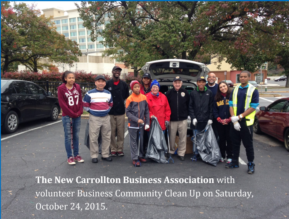
The New Carrollton Business Association with volunteer Business Community Clean Up on Saturday, October 24, 2015.