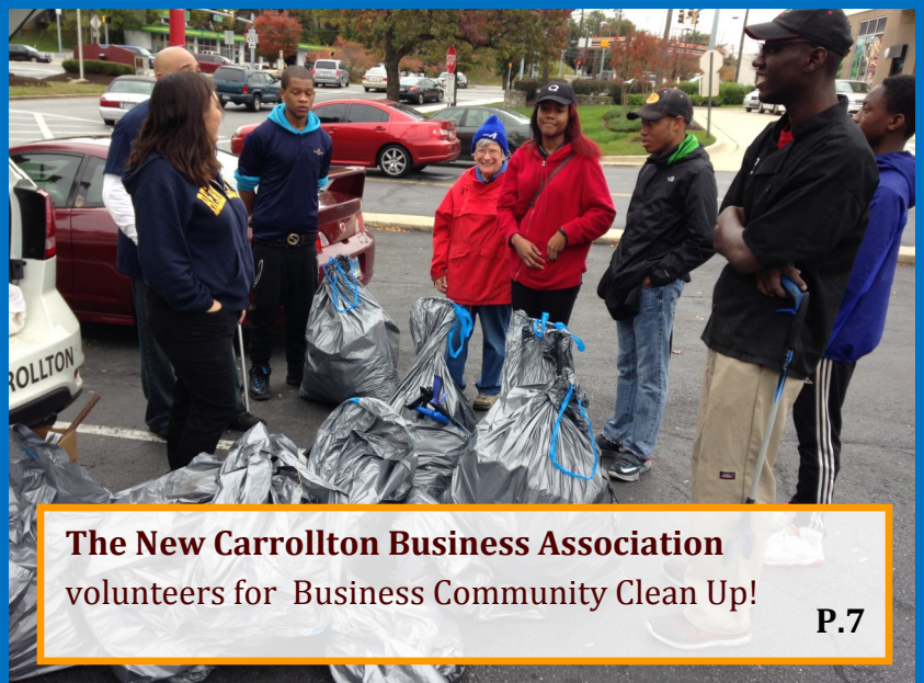
The New Carrollton Business Association volunteers for Business Community Clean Up!