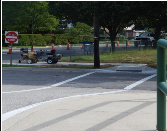
Picture: Crosswalk at Beckett Field, & 85th Avenue