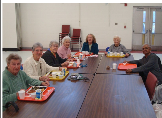
Picture on top: participants of the Prince George's Nutrition Program

Monday through Friday at: New Carrollton Municipal Center 301-459-6100