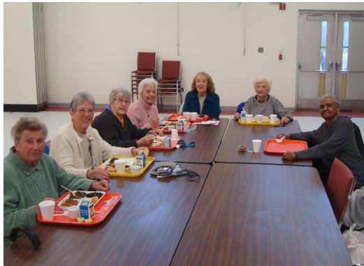
Picture on top: participants of the Prince George's Nutrition Program

Monday through Friday at: New Carrollton Municipal Center 301-459-6100