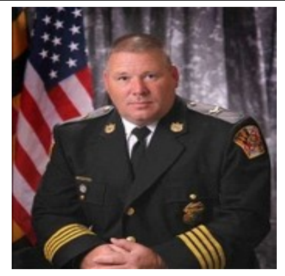
On behalf of the New Carrollton Police Department, I would like to wish everyone a Happy New Year!

A reminder: a car running with keys in the ignition unattended can be dangerous, and it gives an opportunity for thieves to steal your vehicle and or receive a Maryland State Citation.