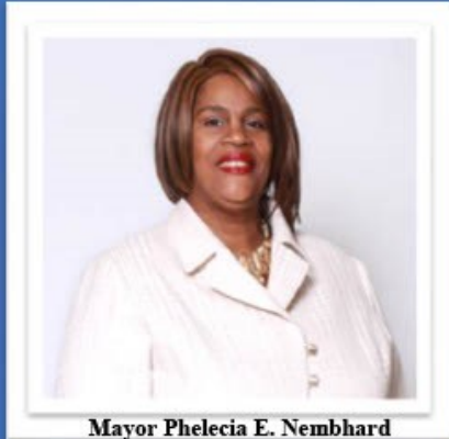
Mayor Phelecia E. Nembhard