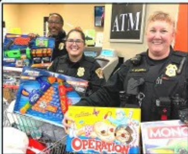
New Carrollton Police Officers