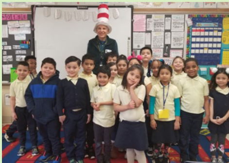
The Mayor celebrating Dr. Seuss at Lamont Elementary

I had a blast with the elementary kids during the Dr. Seuss Read Across America week. I spent several days making visits to Robert Frost, Carrollton Elementary, and Lamont Elementary schools. I applaud the teachers and administrators for their work. I am also impressed with our young learners in these classes. They love to read and are full of questions. I am convinced that I have read to future New Carrollton mayors and councilmembers during Dr. Seuss week.