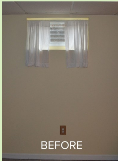
Window without egress

Egress windows (or doors) are required in every habitable space. Especially in any room used for sleeping purposes, it will require its own egress window. Remodeler: if you have an existing home and you add a sleeping room, or finish a separate living space in the basement, the code requires that you install an egress window to serve these spaces. Without a means of egress, these rooms can represent a dangerous firetrap if you do not have a quick and easy to operate emergency egress escape window. If you have a basement that has a bedroom, recreation room, den, family room, media room, office, or home gym. All of these rooms are required to have a means of egress/escape.