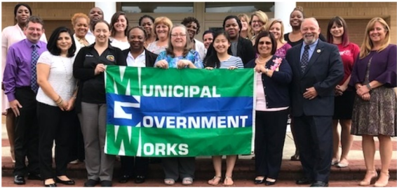
Maryland Municipal Clerk's Association Quarterly Meeting– LaPlata, MD Sept. 2018

Council Legislative Meeting – Wednesday, August 15, 2018